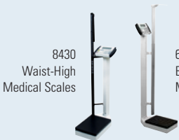
8430 Waist-High Medical Scales