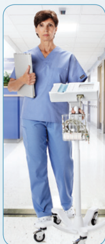
CP 50 Rolling Cart, Part # 406815