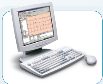
Welch Allyn CardioPerfect™ Workstation