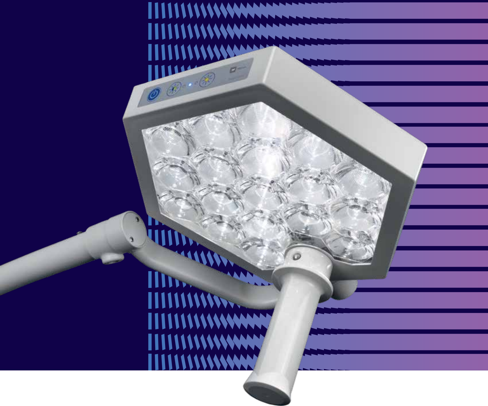
TL 1000 Exam Light Wide range of applications