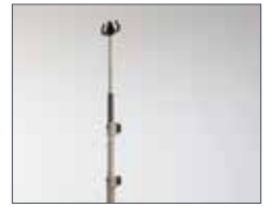
Permanent 3-Stage IV Pole