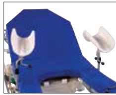
Telescoping Calf Supports