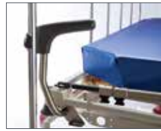
Ergonomic Push Handles with exclusive IV Pole Holder