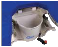
Integrated Catch Basin