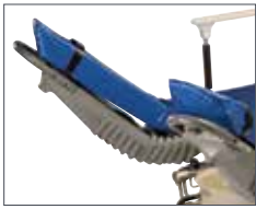
Infinite Positioning Foot Supports

A safe and comfortable experience for both you and your patient starts on a Hill-Rom® stretcher.