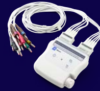
Welch Allyn Wireless Acquisition Module (WAM)