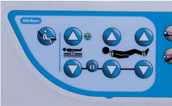
Low height indicator and One-Touch Side Egress positioning