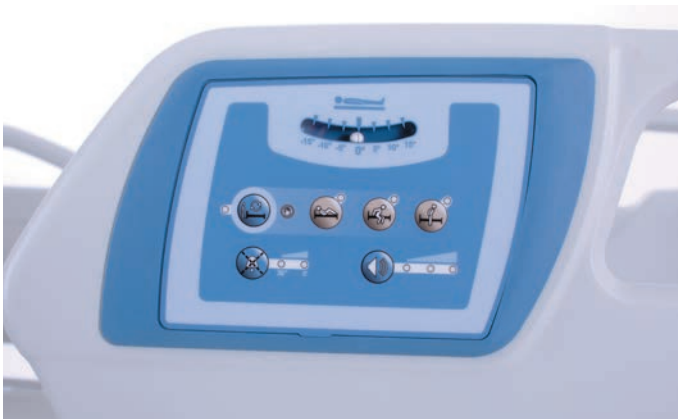
3-Mode Bed Exit Alarm