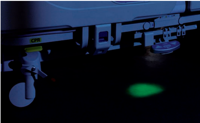
Optional intelligent night light