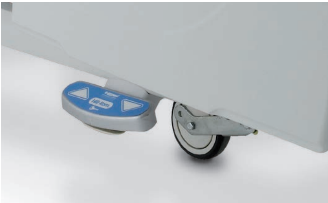
Optional bilateral high-low foot control with automatic lock-out and 5th steering castor